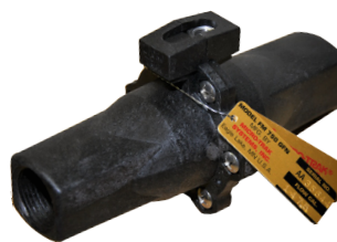
XFM750 GFN flow meter

Flow meters are an important part of the fertilizer application process when using any automated control to manage flow rates. Our line of flow meters will meet your specific needs and requirements. AgXcel's XFM750 GFN series will meet many fertilizer application requirements. For more precise meter management, our line of Xorion Flow Meters may be utilized.